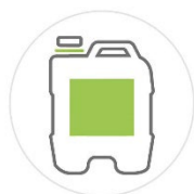
8 Kg CANISTER