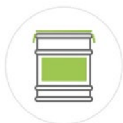
250 Kg DRUM

Please verify the packaging details, including volume and availability, with your sales representative, as they may vary depending on the production facility where the product is manufactured.